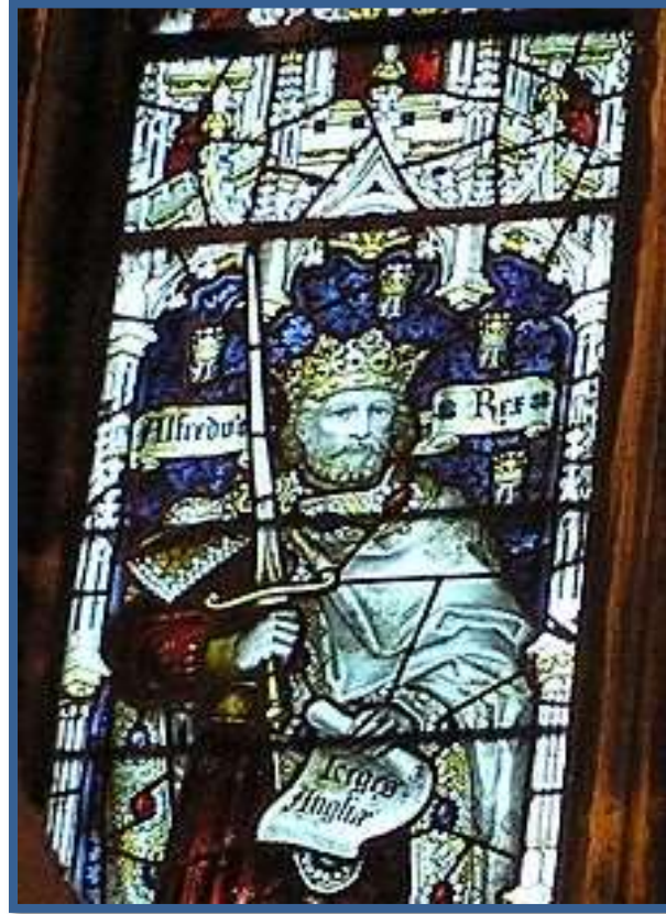
Alfred "the Great" featured on the stained glass window at the South Transcript of Bristol Cathedral.