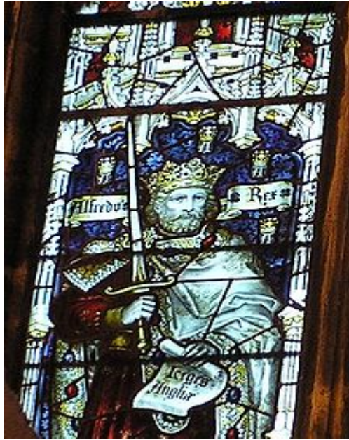
King Alfred "the Great" featured on the stained glass window at the South Transcript of Bristol Cathedral.